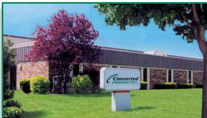
CPI Headquarters in Milwaukee, Wisconsin.

CPI is a leading supplier and converter of many substrates used in the automotive industry. From their headquarters in Milwaukee, Wisconsin, USA, CPI has over 35 years of experience as a leading source in the supply and conversion of a variety of flexible materials including tissues and paper, nonwovens, adhesive tapes, foils, laminates and films. CPI is spread across a variety of markets and industries which go beyond automotive applications to include building trades, consumer products, electrical, electronics, medical and filtration/acoustic arenas.